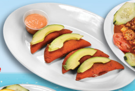
Empanadas de Camarón (4) 12 99 (8) 24 99

Tortilla chips served with beans, cheese, guacamole, sour cream and jalapeños